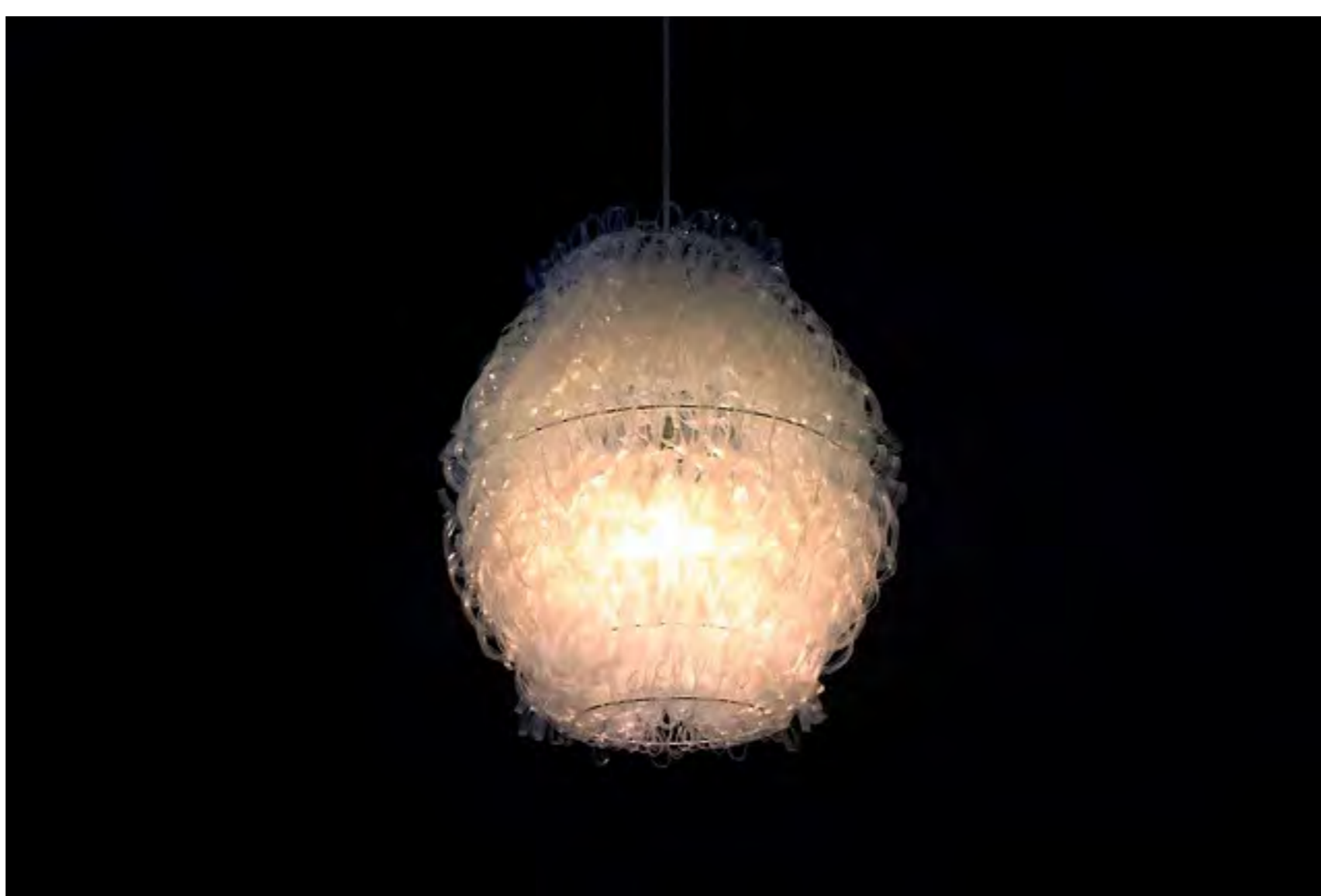
432 lotus pendant

The ethereal pendants are assigned names with numbers. The numbers refer to the amount of six pack rings used to make the lamps.