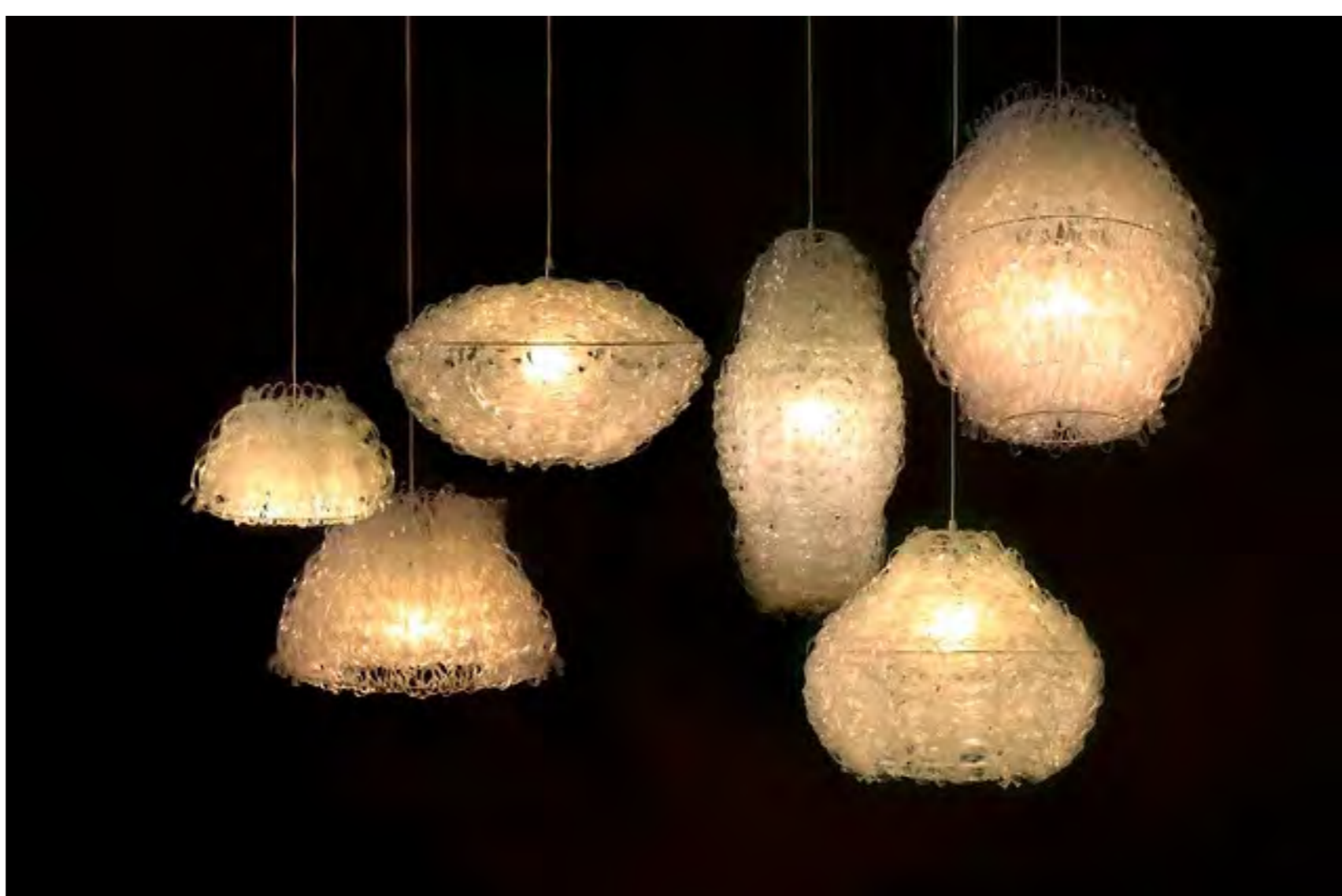
relevé design collection