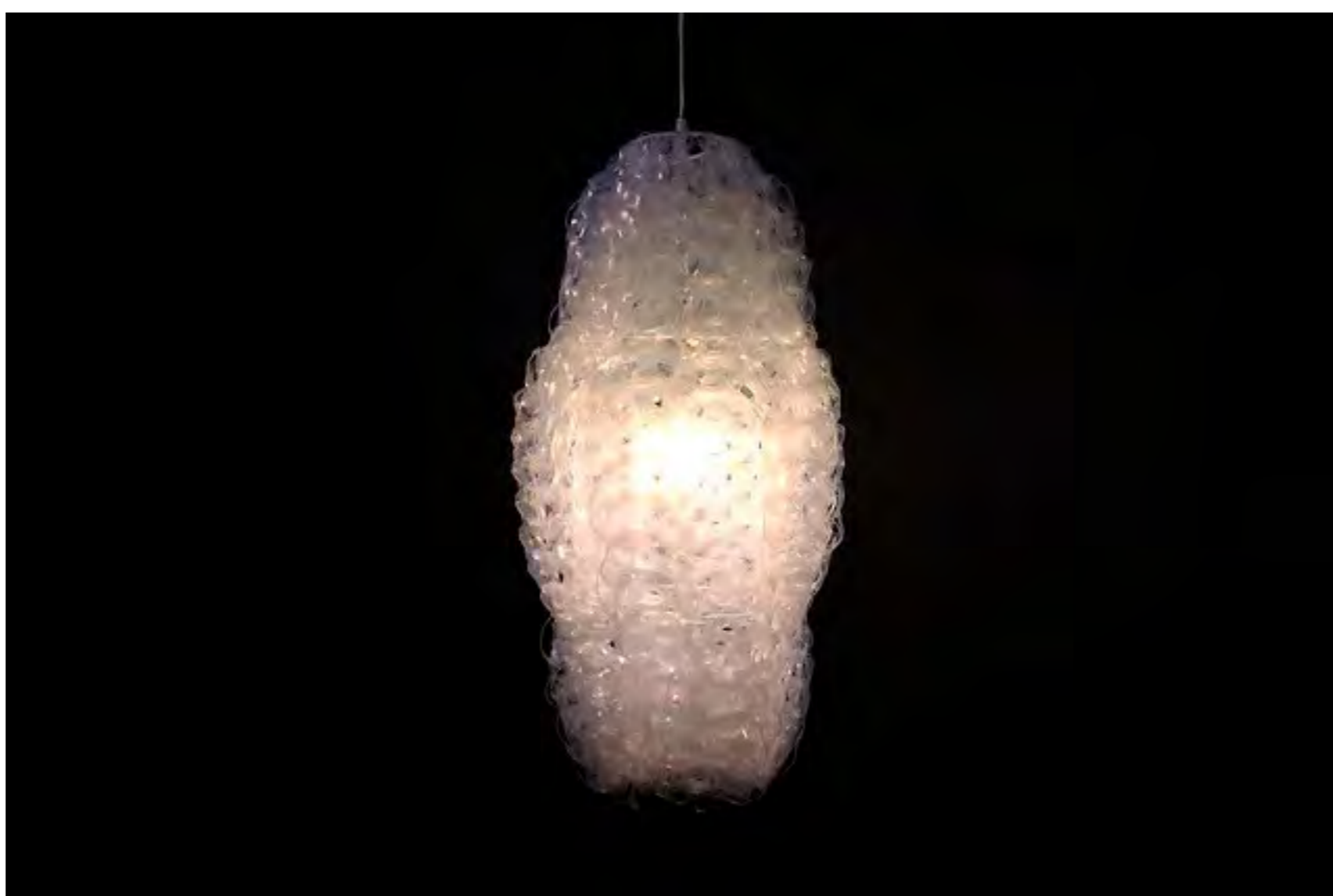
229 pod pendant